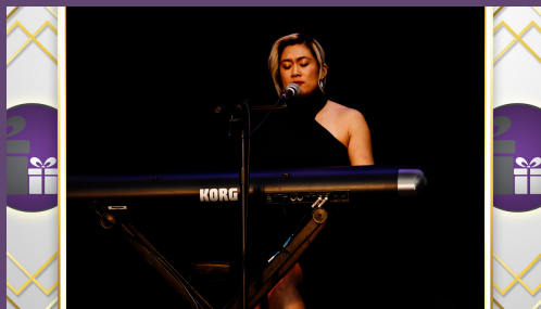
Honoree Connie Lim AKA MILCK